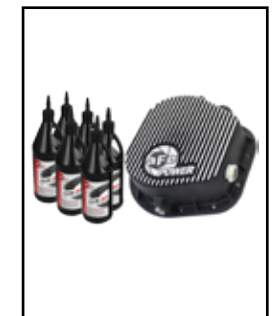
P/N: 46-70022-WL (w/ Oil) 46-70022 (Blk) 46-70020 (RAW)