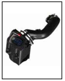
P/N: 50-73006 (P10R) 51-73006 (PDS)