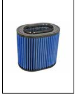
P/N: 10-10139 (P5R) 11-10139 (PDS) 71-10139 (PG7)