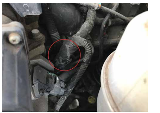
STEP 3 PLUG IN THE GDP 3 PIN UNLOCK CABLE