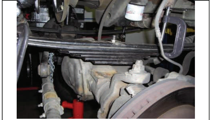
Tighten new leaf stack to OE leaves with provided nut