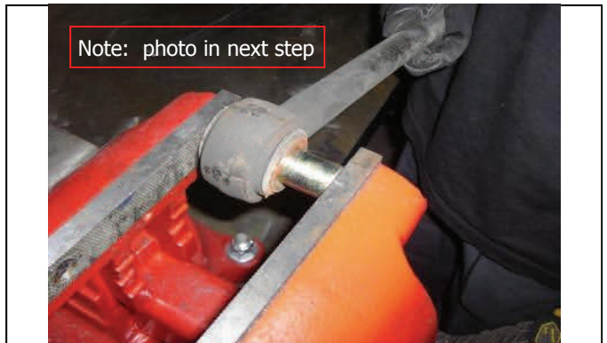
Then press new offset sleeve as shown. DO NOT HAMMER!