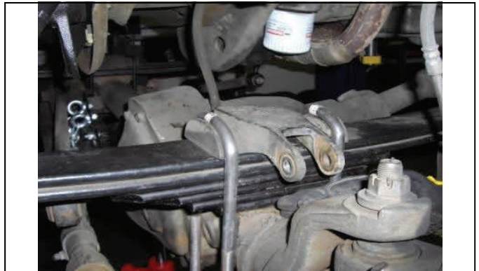
Replace spring plate with new longer U-bolts