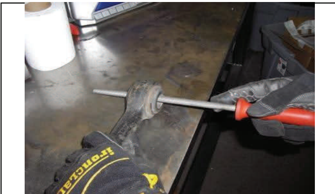
On both ends of the trac bar use a file to smooth inner sleeve