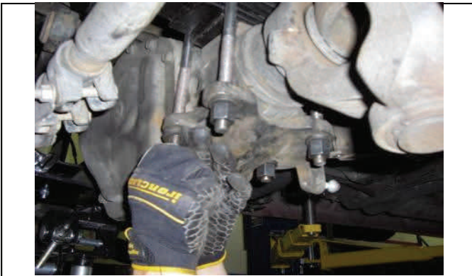
Attach lower spring plate with new hardware and tighten