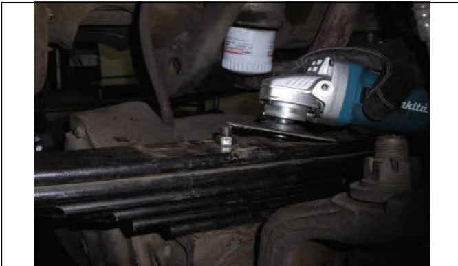
Grind excess threads to allow proper fitment of spring plate