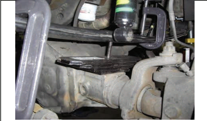
Remove nut from new center bolt and place into position