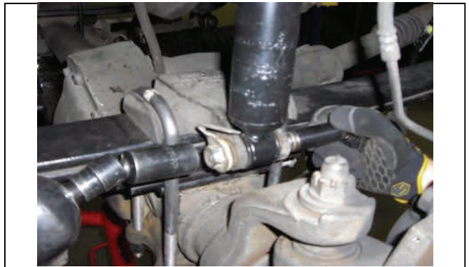
Reinstall lower shock into original position with OE hardware