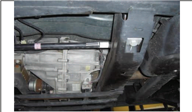
Raise and support vehicle on jack stands, locate torsion bars