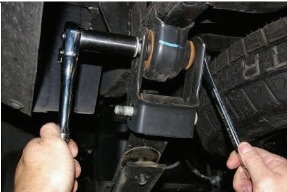
Support axle and disconnect/remove shackles and hardware.