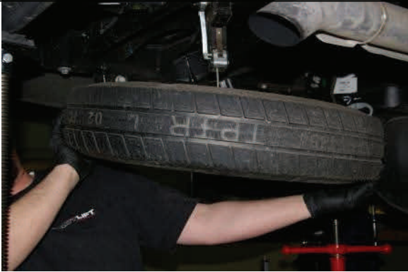
Remove spare tire in order to remove shackle bolts