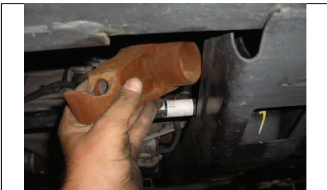
Remove OE torsion key