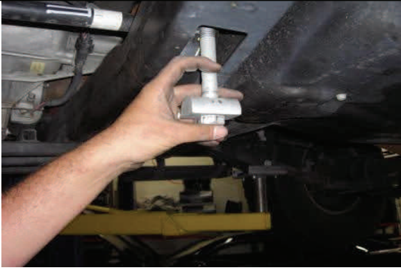
Reinstall adjustment bolt and block to original measurements

Note: Torsion bars can be adjusted to the initial thread measurements on the adjusting bolts. Once the rear parts are installed and with the vehicle on the ground the necessary adjustments can be made and finalized by the alignment shop.