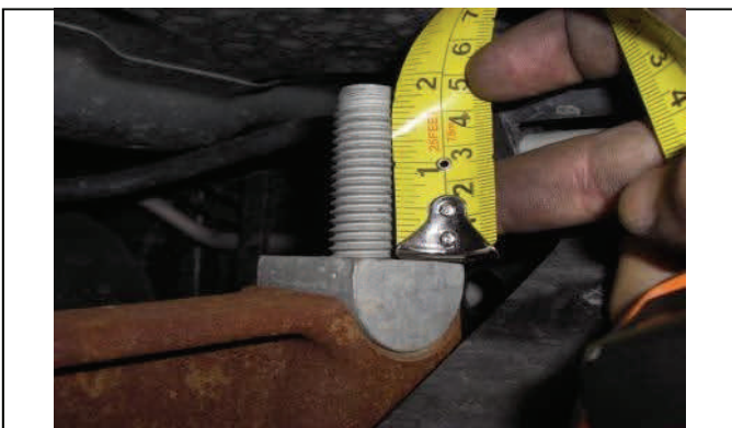
Measure threads on top of torsion bar adjusting block