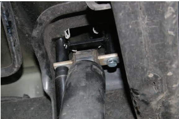
Install upper shock extensions and new hardware.

Reinstall wheels/tires and torque to spec. Re-check all work performed and torque all hardware to spec. Test drive and have vehicle aligned.