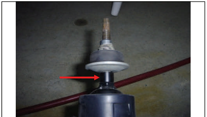
Install spacer underneath bottom shock bushings