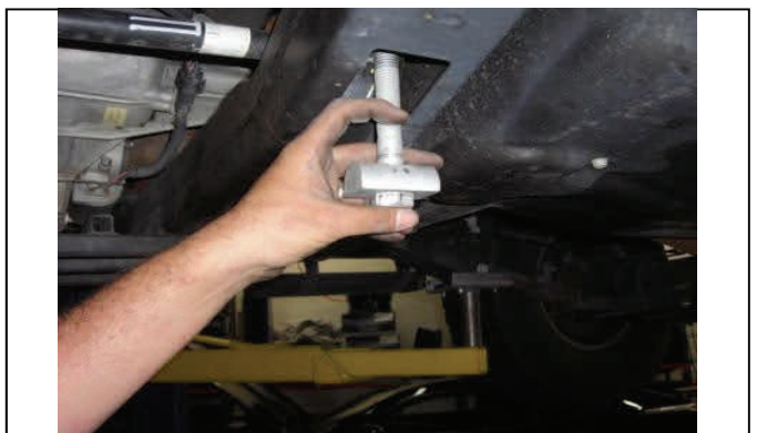
Then remove torsion bar adjusting block and bolt