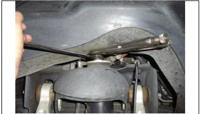
Remove upper shock mounting hardware