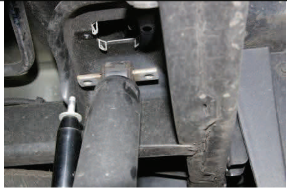
Disconnect upper shock mounting bolts