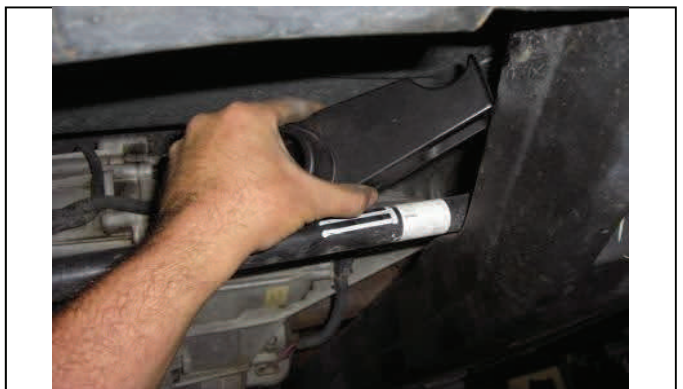
Install new ReadyLIFT forged torsion key