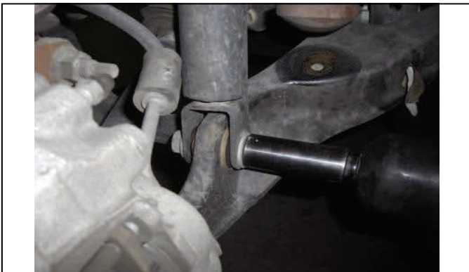
Remove lower shock mounting bolt/nut