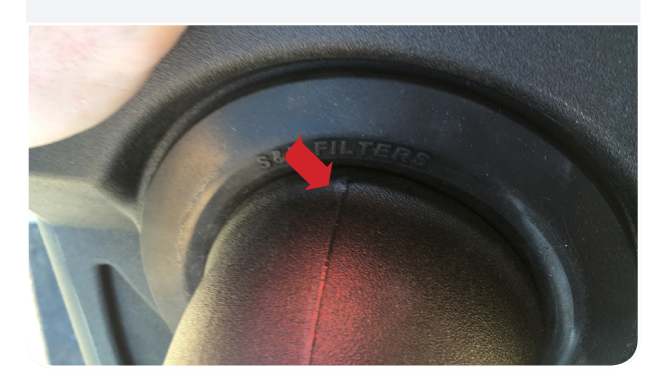
Determine if you want to install the Box Plug (Q) "Step 20" or Auxiliary Scoop (P) "Step 21" onto the Air Box (A). See the "Air Box Plug" note on Page 2 to decide the desired setup. To install the box plug, install the 1/4-20 Screws (M), Lock Washers (N), and Washers (O) with a 10mm Socket/Wrench from inside the air box then proceed to Step 22.

Insert the Intake Tube (C) into the Air Box (A). The intake tube stop bead should meet up to the Tube Seal (B).