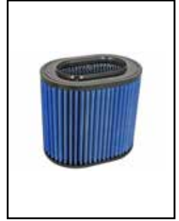
OER Air Filter

P/N: 10-10139 (P5R) 11-10139 (PDS) 71-10139 (PG7)