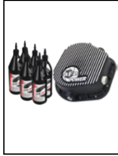
Rear Differential Cover

P/N: 46-70022-WL (w/ Oil) 46-70022 (Blk) 46-70020 (RAW)