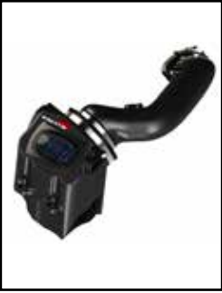
Cold Air Intake System