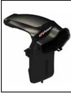
Air Intake System Scoop