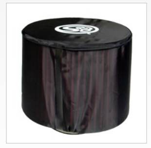
Air Filter Wrap SKU# WF-1023