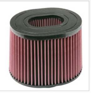
Replacement Cotton Filter SKU# KF-1035