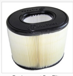
Replacement Dry Filter SKU# KF-1035D