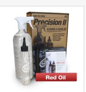
Precision II: Cleaning & Oil Kit SKU# 88-0008

Order online today at www.sbfilters.com or through your local S&B distributor.