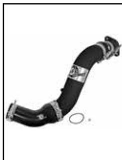
Cold-Side Intrcooler Tube