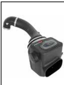
Momentum HD Intake