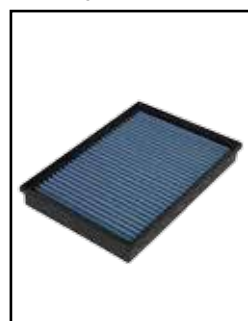
OE Replacement Filter