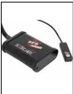
SCORCHER GT Module