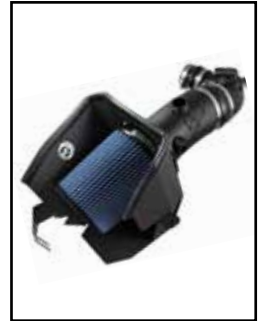
Intake System "Magnum Force"

P/N: 54-41262 (P5R) 51-41262 (PDS) 75-41262 (PG7)