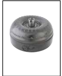
F3 Torque Converter