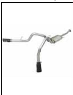
Cat-Back Exhaust System

P/N: 49-43070-B (Blk. Tips) 49-43070-P (Pol. Tips)