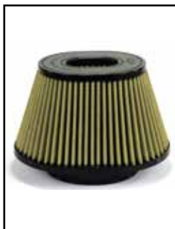
Pro-GUARD 7 Air Filter