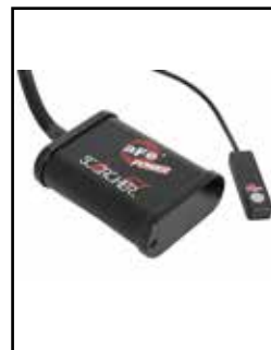
SCORCHER GT Module