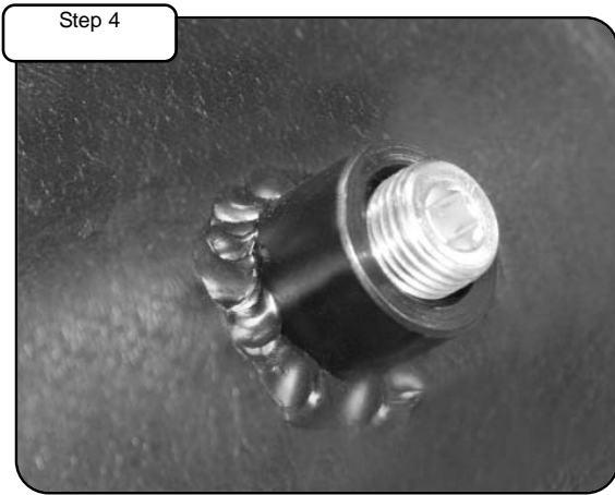
Install plugs in to 1/8" NPT ports with 3/16" hex key. Use teflon pipe sealant tape for leak tight fit.