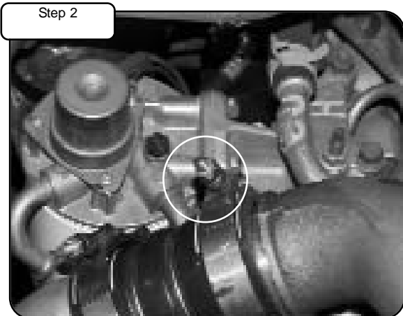
With 7/16" deep socket, loosen clamp on manifold.