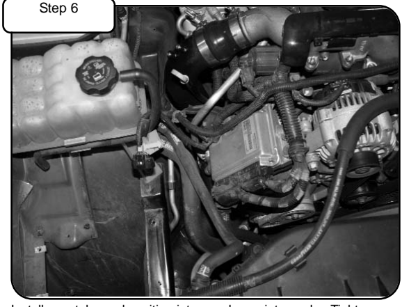
Install new tube and position into coupler on intercooler. Tighten and torque all clamps to 75 in-lbs.. Reinstall the air intake system and your intercooler tube installation is now complete. Thank you for choosing aFe power!

Place the included CARB EO sticker on or near the Intercooler Tube on a smooth, clean surface. EO identification label is required to pass the Smog Check Inspection.