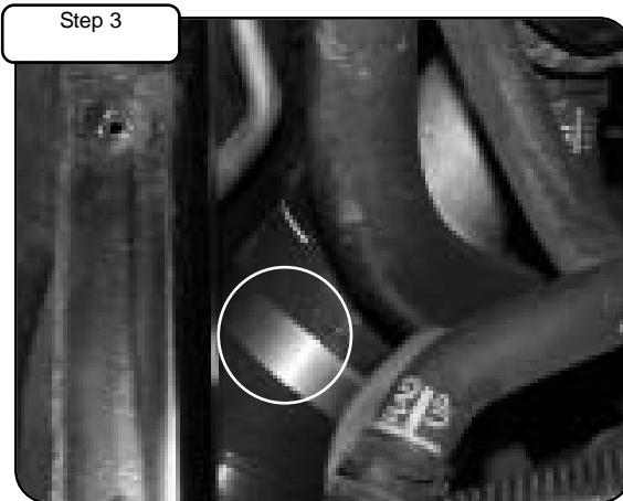
With 7/16" deep socket, loosen clamp on intercooler coupler. Push down on intercooler tube and disconnect from manifold. Remove stock intercooler tube from vehicle.