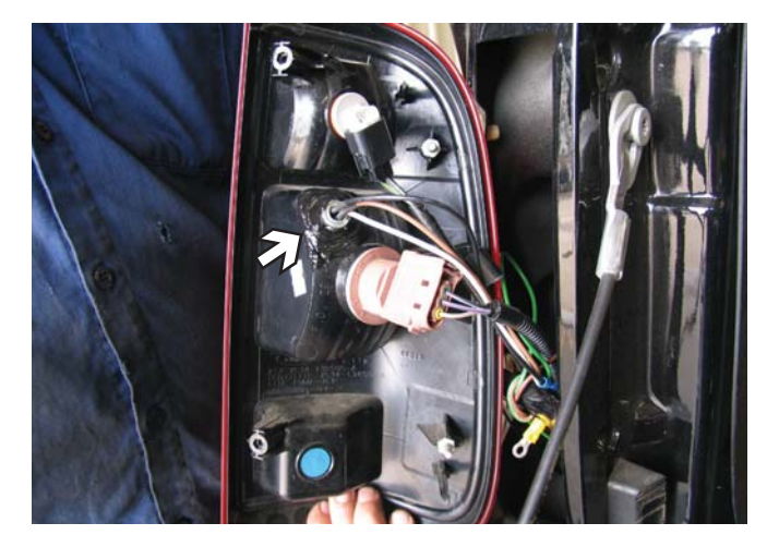
Possible Location for the EX3339 Build and Socket Wiking Kitt

The BX8869 Bulb and Socket Wiring Kit is recommended for this vehicle.